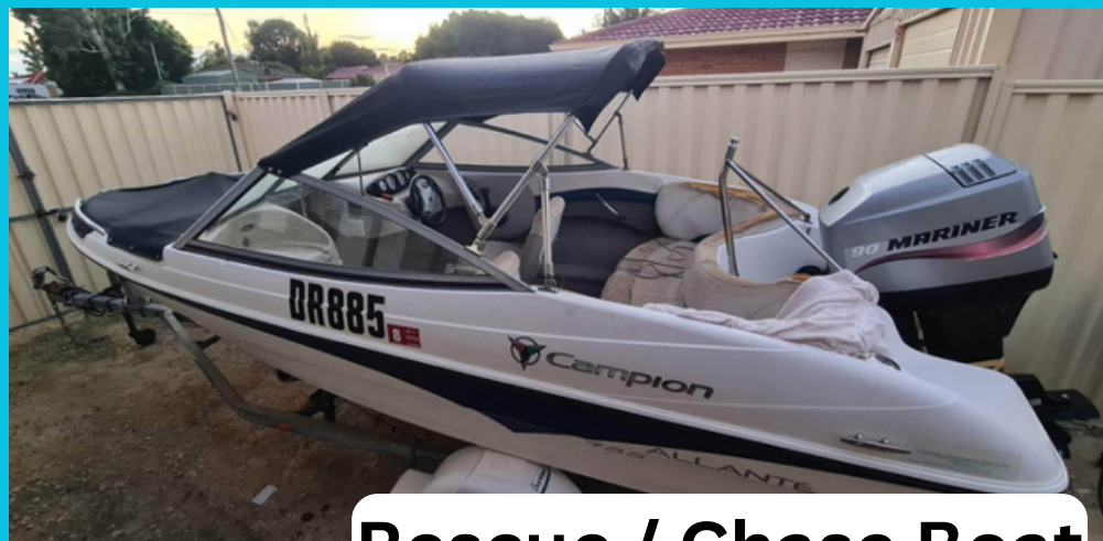
Rescue / Chase Boat