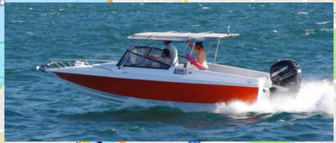
Turn 2 - THE JENKS