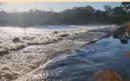
Northam Weir 8/6/23