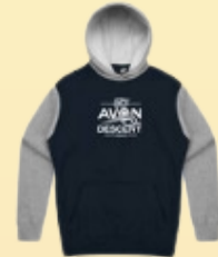
AVON 50YR FLEECE HOODIE $60.00 AUD