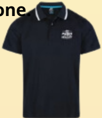
AVON 50YR POLO $45.00 AUD