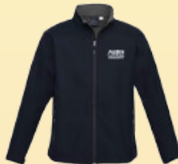
AVON MENS SOFTSHELL JACKET $85.00 AUD