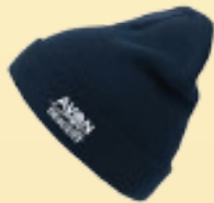
AVON BEANIE $20.00 AUD