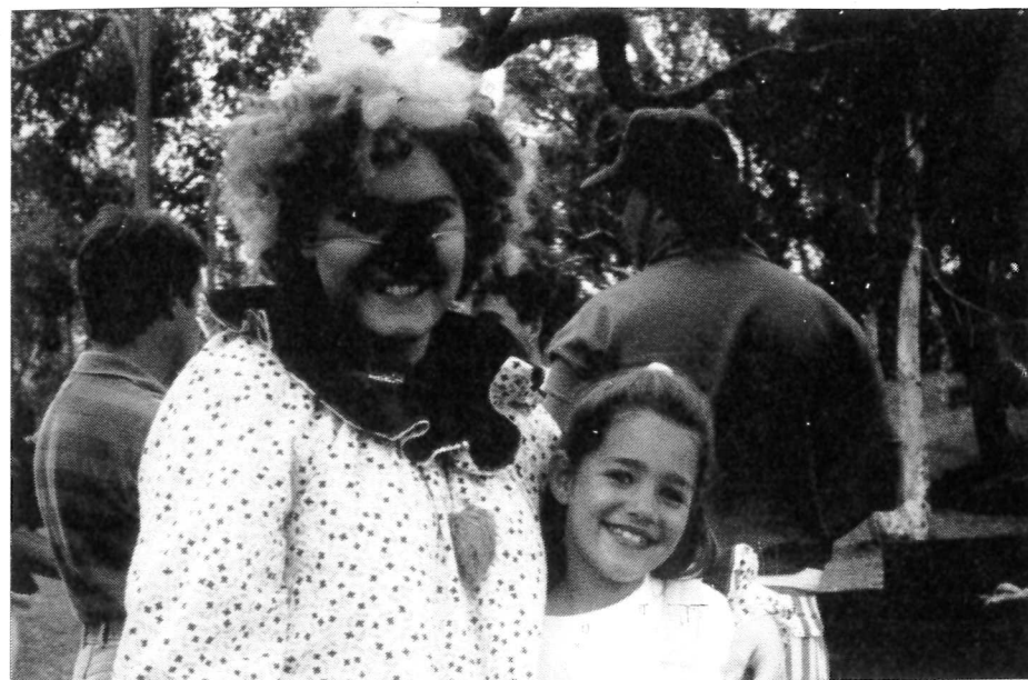
A good time was had by all at the recently held car rally.

POWER DINGY RACER 20 Lawrence Street Gosnells 6110