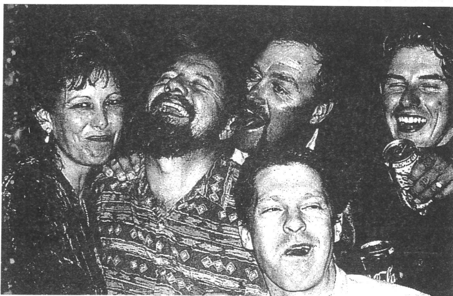
An excerpt from this years christmas party

One of the new partnerships in 10hp combining two past winners of the Avon record another DNF in their latest outing. Thats two out of two. You can't beat that for consistency. Are we going for three in a row??