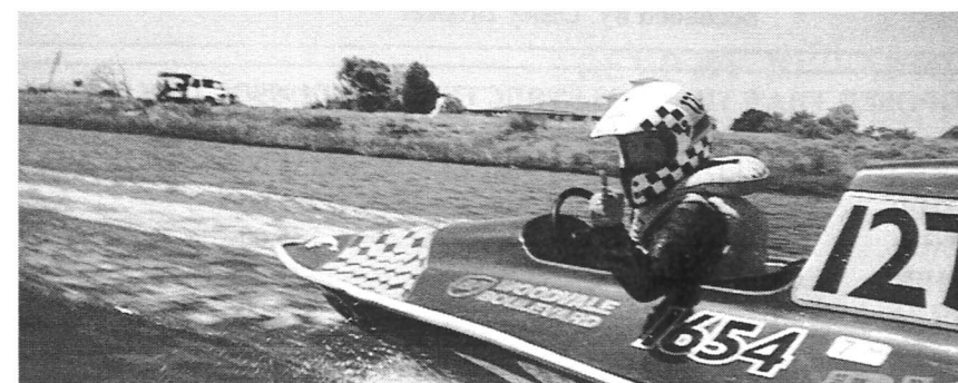
GOOD ONE VENN